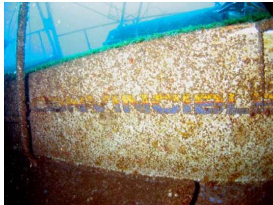
Pretty coloured name