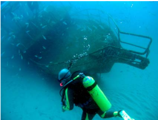
Nev and CONVINCIBLE