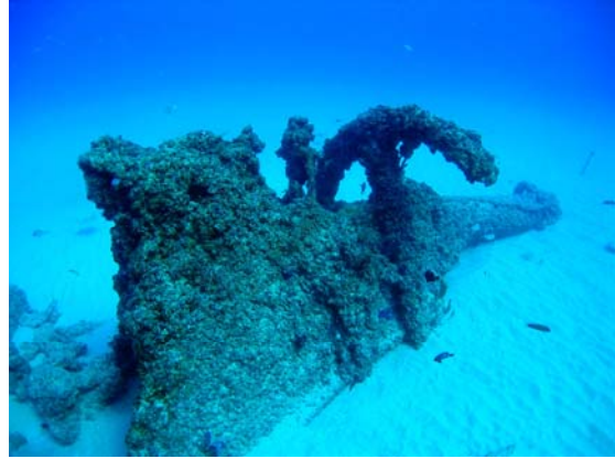
Admiralty anchor and bowsprit