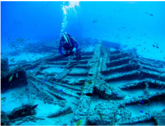
Collapsed deck plating