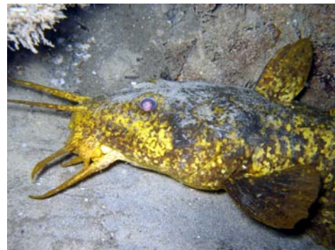
A large Juvenile Estuary Catfish