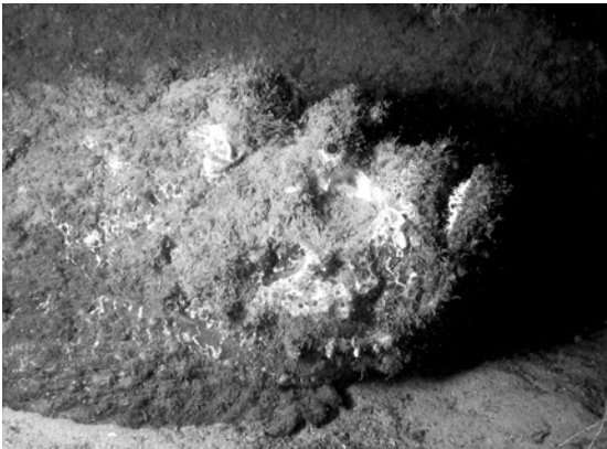
Estuarine Stone fish

It was a great day and hot. Four of us kitted up and one came later. We walked seaward for a while and clambered down the large jagged boulders to a reasonable entry point. The sea was calm although the wind got up later and it looked a little rough outside. We dived near the top of the incoming tide but there was still a good deal of current. This was not a spectacular dive but it was good to get wet. A large school of bait fish circled about us and provided some photo opportunities. It was a little more mucky down under than it appeared from the surface but vis was reasonable. Large hydroids (like a small bush) added interest in the algal and sand covered rocks.