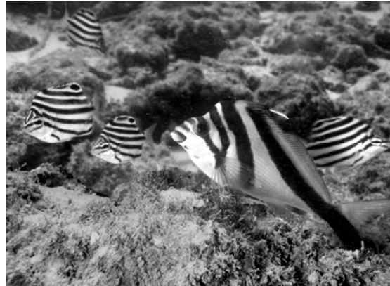
Morwong and Stripeys

There were a number of colourful reef fish (Bannerfish, Morwongs, Stripeys) and little crays poked their heads out and leatherjackets fluttered around their little territory. We drifted to the pipeline that goes straight out across the seaway and found a lot more life there. Linton spotted a huge estuarine stone fish near the entrance end of the pipe. Its mouth gaped open with a whitish inner. After the necessary photos, it moved to reveal its huge size and effective camouflage. Other species of Scorpion/stone fish also live on the pipe and I was fortunate