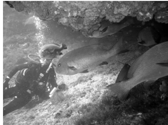
Netted Sweetlip under ledge

For the second dive we tried Manta Bommies but, because it was too rough, returned to the Northern area of Flat Rock. We dived in about 18 metres near a small wall with some fan coral and a lot of fish. The wall dropped off gently to 25-30 metres on the sand. A leopard shark cruised by. Some divers went further around to the north and swam with a Shark Ray and a number of leopard sharks and captured some good digital images.