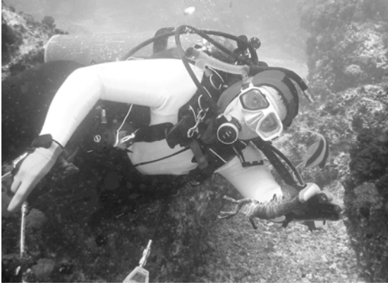
Linton in limbo