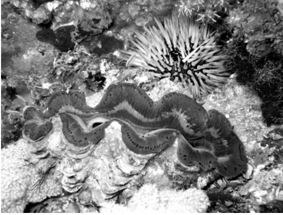
Clam and burrowing Matha's Sea Urchin